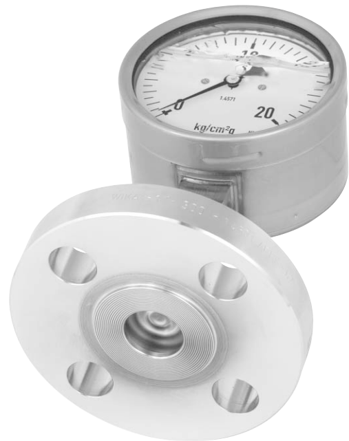
Diaphragm Seal, Flanged Process Connection Model 990.26 with Pressure Gauge Model 233.50 NS 100